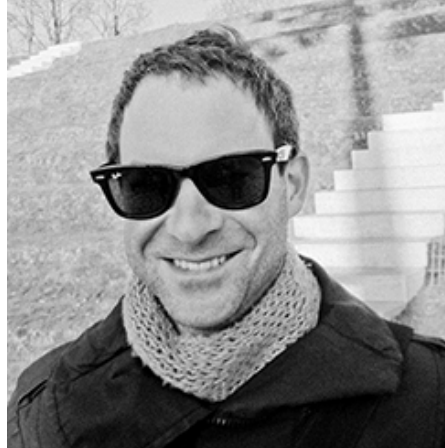
Award for Outstanding Achievement as an Artist