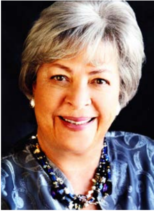
Gerda Hnatyshyn, C.C.