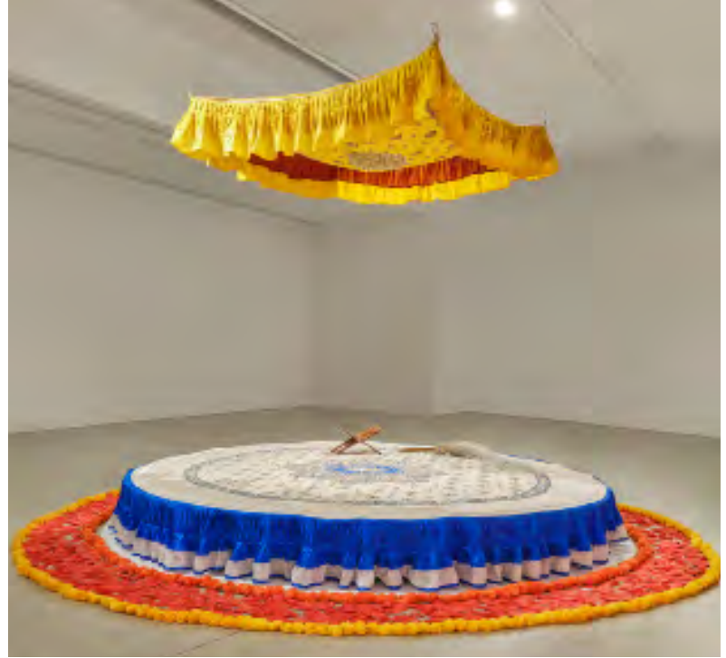
Simranpreet Anand , Bande chasm deedn fanaai , 2021